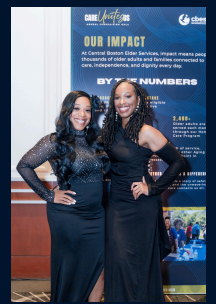
CARE UNITES US 2025 | The Westin Copley Place, Boston | 350+ Guests